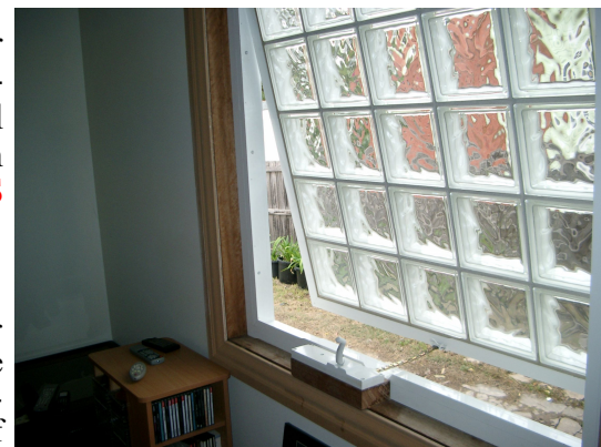
The latest innovation: entire windows that open exclusive to Absolute Brilliance Glass Bricks

Check out our website for the latest design ideas and loads of useful info.